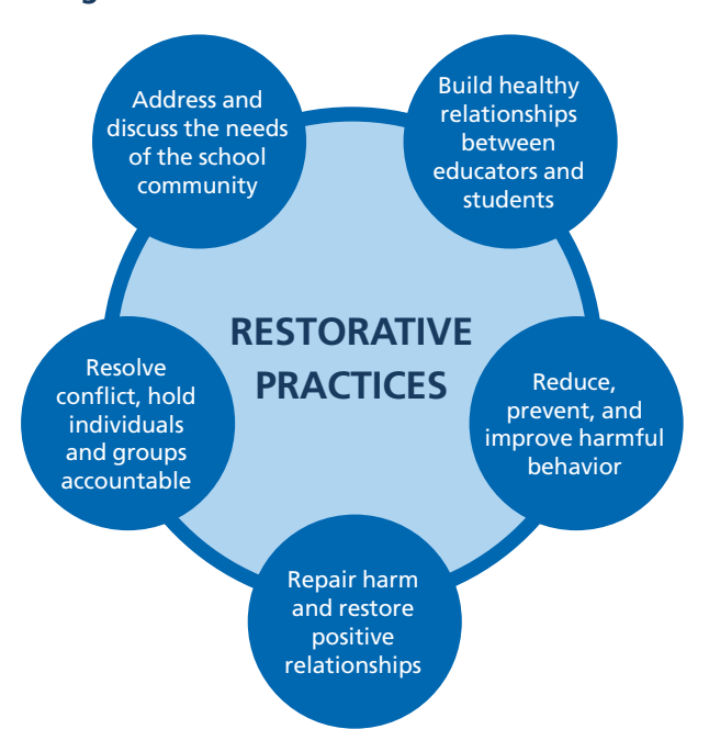
Figure 1. What Are Restorative Practices?

ment a school's ongoing initiatives (e.g., Positive Behavioral Interventions and Supports, social and emotional learning programs) by offering alternatives to suspensions and expulsions and building a foundation for addressing issues guickly and thoughtfully.