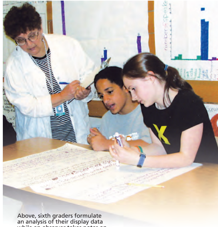
Above, sixth graders formulate an analysis of their display data while an observer takes notes on their thinking. Below, an example of fourth-grade student work from a Rochester, N.Y., study lesson on place value.